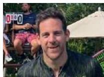
Juan Martin Del Potro