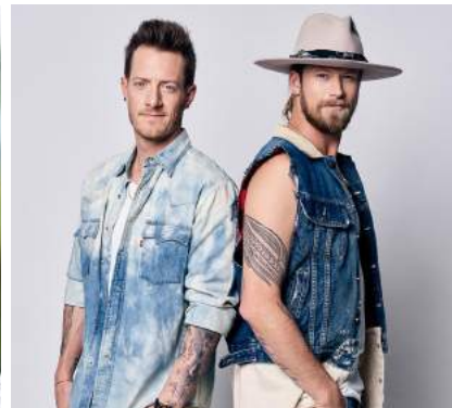
Florida Georgia Line